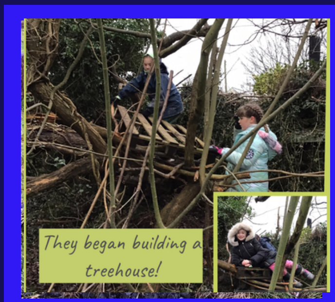
They began building a treehouse!