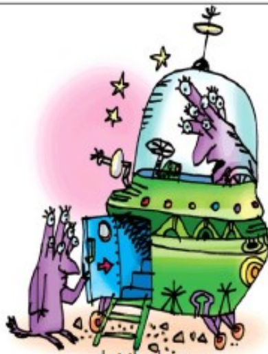
shut the door

2. car , bar , star , park , smart , start , sharp , spark