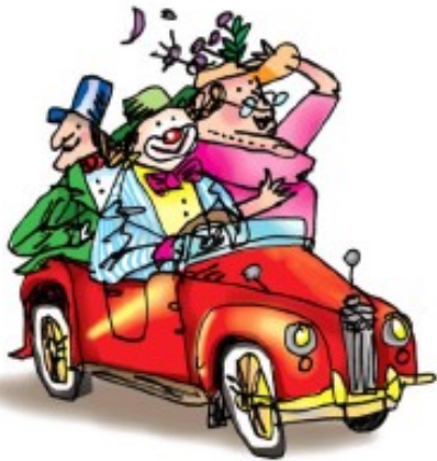
start the car

2. car , bar , star , park , smart , start , sharp , spark