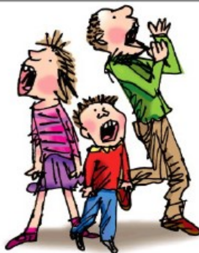
shout it out

2. girl , bird , third , whirl , twirl , dirt