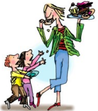
that's not fair

2. sort , short , worn , horse , sport , snort , fork