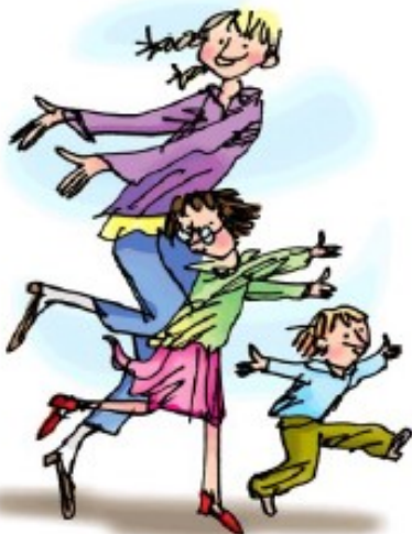
whirl and twirl

2. fair , stair , hair , air , lair , chair