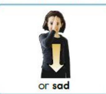
Hand moves from the front of the face downwards to chest height